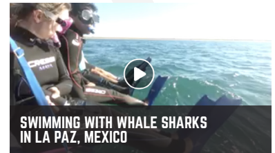
SWIMMING WITH WHALE SHARKS IN LA PAZ, MEXICO