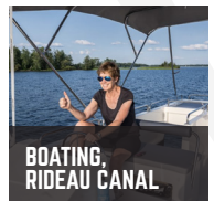
BOATING, RIDEAU CANAL